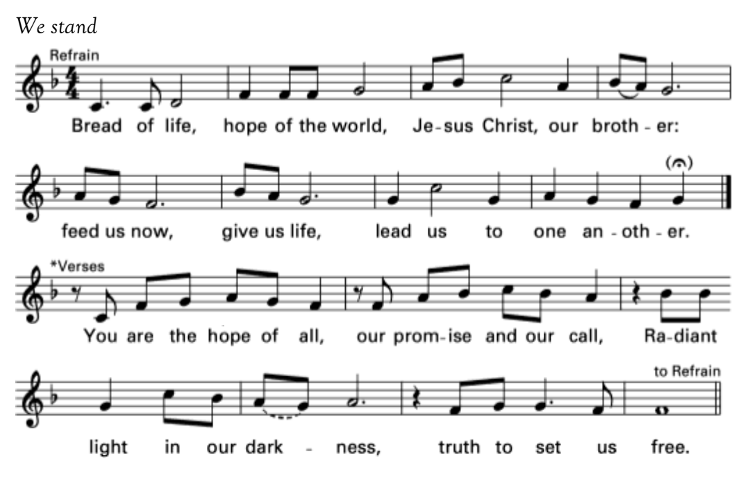
*Verses 1-2, Advent; verses 3-5, Christmas. © 1982, 1987, Bernadette Farrell. Published by OCP Publications. All rights reserved.