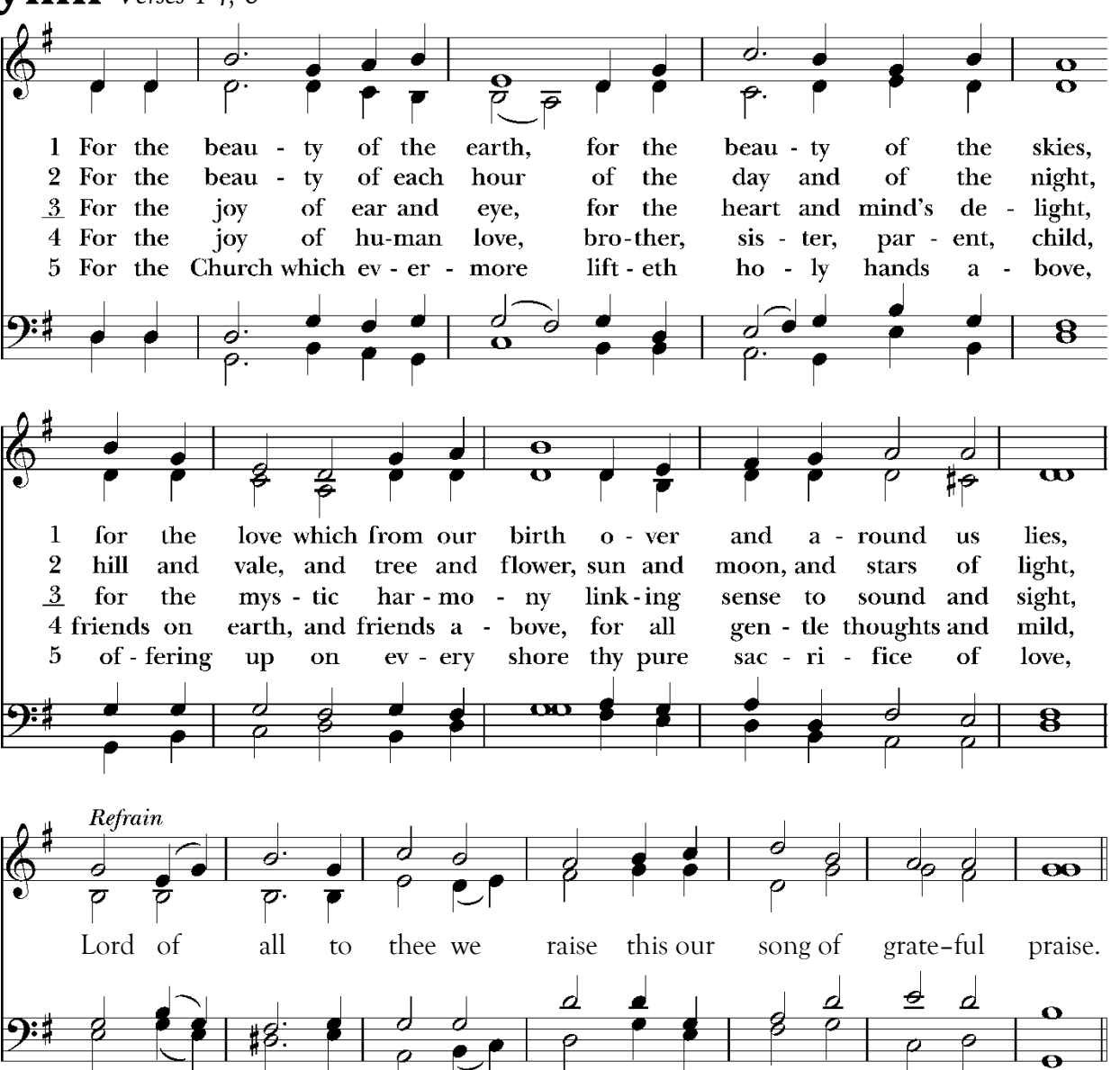
6 For each perfect gift of thine to the world so freely given, faith and hope and love divine, peace on earth and joy in heaven,