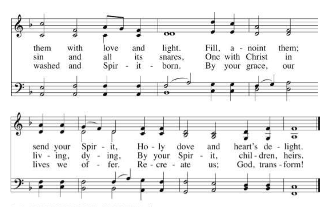
Text: Roth Duck, b.1947, © 1989, The United Methodist Publishing House Tune: BEACH SPRING, 8 7 8 7 D, The Socred Harp; harm, by Ronald A. Nelson, b.1927, © 1978, Lutherum Book of Worship; admin. by Augsburg Fortress